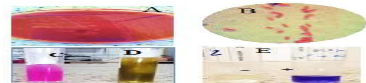
Figure 1: A. colonies of Campylobacter on media Preston and Skirrow Selective B. Bacilli Campylobacter under microscope, C. Urease test, D. product of H2S test, E. Hippurate hydrolysis test